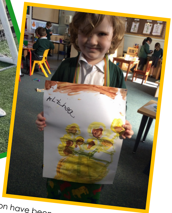
Children in reception have been enjoying painting in the style of Vincent Van-gogh and writing independently