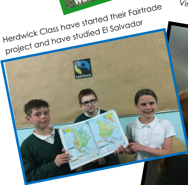
Herdwick Class have started their Fairtrade project and have studied El Salvador