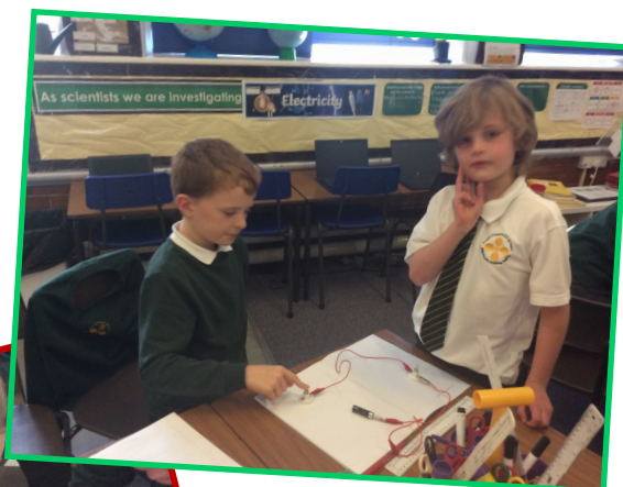
Oxford class have been exploring electrical circuits in Science