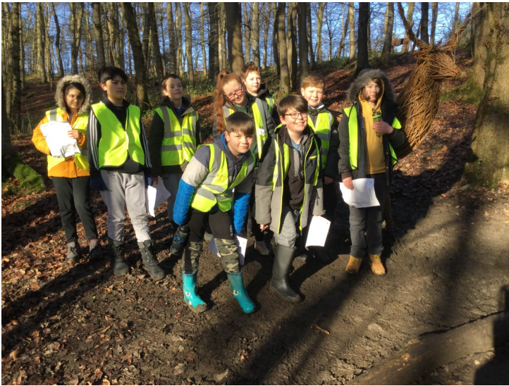
Year 6 pupils who remained in school spent a morning getting muddy in Skipton Woods.