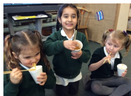
Suffolk class enjoyed trying some Chinese food and learning how to use chopsticks as part of their Chinese New Year celebrations. They have also been doing peer-massage for mindfulness and have taken part in a dough disco to develop fine motor skills.