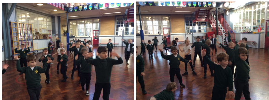
Swaledale class have been learning Indian dancing in PE lessons.