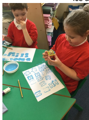
Cotswold class have been focusing on printing repeated patterns in Art this week. Some children have alternated colours or rotated their print.