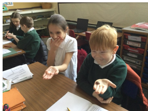
Dalesbred class have been looking at states of matter in science this week and were investigating the effects of heat on ice and chocolate