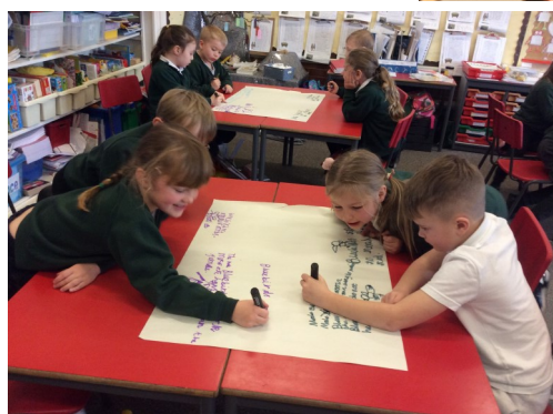
Teeswater class have been planning non-fiction writing in teams.