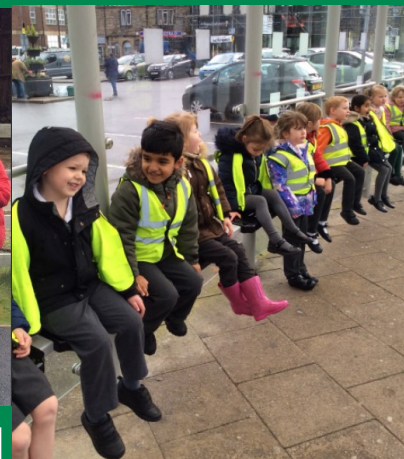
Suffolk Class enjoyed a trip on a bus to Keelham Farm Shop this week.